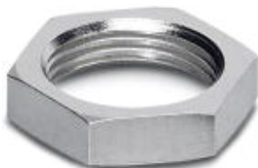
Flat nut with M8 thread

Please be informed that the data shown in this PDF Document is generated from our Online Catalog. Please find the complete data in the user's documentation. Our General Terms of Use for Downloads are valid ( http://phoenixcontact.com/download )