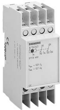
Voltage relay T5570 AC 230/400V 2W 0.7/0.9 With transparent cap