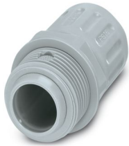
Cable gland made from PP with metric thread, rotatable, IP54 protection

https://www.phoenixcontact.com/in/products/3241013