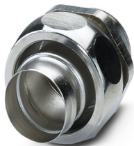
Cable gland made from brass with metric thread, IP40 protection

https://www.phoenixcontact.com/in/products/3241048