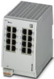
Managed Switch 2000, 16 RJ45 ports 10/100/1000 Mbps, degree of protection: IP20, PROFINET Conformance-Class A

Please be informed that the data shown in this PDF Document is generated from our Online Catalog. Please find the complete data in the user's documentation. Our General Terms of Use for Downloads are valid ( http://phoenixcontact.com/download )