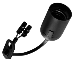
140215 Renovation Lampholder E27 TP Black 2x0.75mm2 15cm