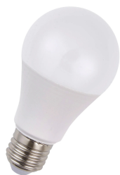
146310 LED A60 E27 95-265V AC/DC 11W (74W) 1050lm 827 Opal