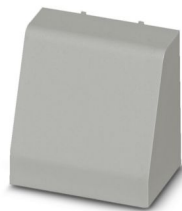
DIN rail housing, Filler plug for unoccupied terminal points (tall design), width: 21.35 mm, height: 19.65 mm, depth: 13.67 mm, color: light gray (similar RAL 7035)

Please be informed that the data shown in this PDF document is generated from our online catalog. Please find the complete data in the user documentation. Our general terms of use for downloads are valid.