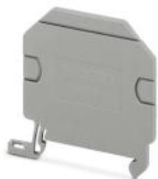
Partition plate, length: 50 mm, width: 2.2 mm, height: 48 mm, color: gray

Please be informed that the data shown in this PDF Document is generated from our Online Catalog. Please find the complete data in the user's documentation. Our General Terms of Use for Downloads are valid ( http://phoenixcontact.com/download )