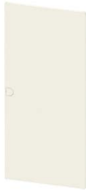
SIMBOX hood-type distribution board Plastic door white 4-tier