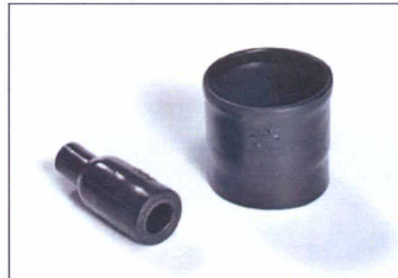
104-4 supplied / fully recovered.

This style is used in conjunction with a circular grooved adaptor providing strain relief and environmental sealing when used in conjunction with one of our complementary adhesives.