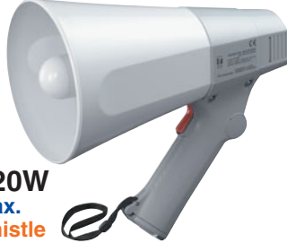
ER-520W 10W max. with Whistle