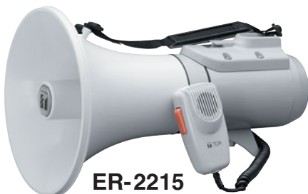
ER-2215 23W max.