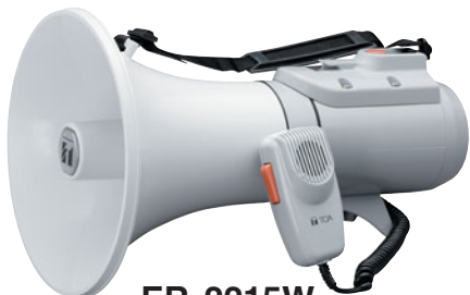
ER-2215W 23W max. with Whistle