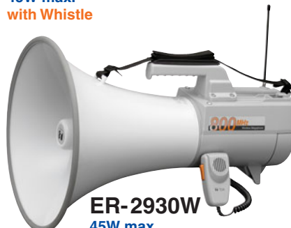
ER-2930W 45W max. with Whistle with Wireless Function