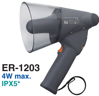
ER-1203 4W max. IPX5*