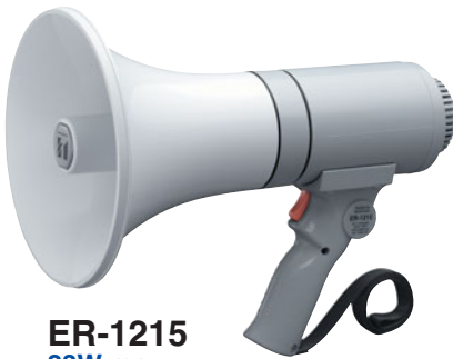
ER-1215 23W max.