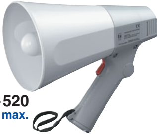
ER-520 10W max.