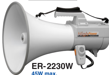
ER-2230W 45W max. with Whistle