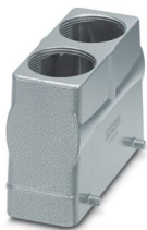
HEAVYCON B24 sleeve housing, for double locking latch, height: 76 mm, with 2 x M40 thread, straight cable outlet

Please be informed that the data shown in this PDF document is generated from our online catalog. Please find the complete data in the user documentation. Our general terms of use for downloads are valid.