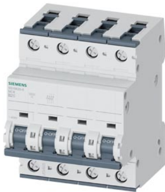
Miniature circuit breaker 400 V 6kA, 3+N-pole B, 20 A, D=70 mm