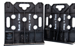
► Original Rack-A-Tiers

HOLDS REELS UP TO: 40" IN DIAMETER REEL WEIGHT RATING: 500 LBS (226KG)