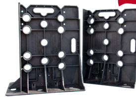
► Rack-A-Tiers XL

HOLDS REELS UP TO: 40" IN DIAMETER REEL WEIGHT RATING: 500 LBS (226KG)