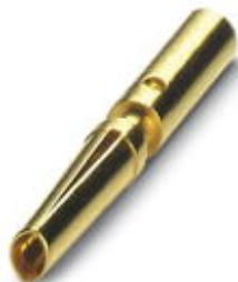
压接插针，车削，触点直径: 0.8 mm，压接范围: 0.08 mm 2 ... 0.25 mm 2

Please be informed that the data shown in this PDF Document is generated from our Online Catalog. Please find the complete data in the user's documentation. Our General Terms of Use for Downloads are valid ( http://download.phoenixcontact.com )