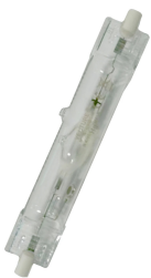
VEN00370 CM-Plus TD 70W/U/UVS/RX7s/830