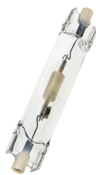
HMC070830TD/01 MASTERC CDM-TD 70W/830 RX7s