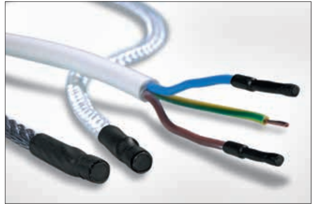
The appropriate end cap for every cable diameter, and cable types.