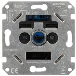
142678 Bailey WW15031 LED Wall Dimmer RC 3-150W