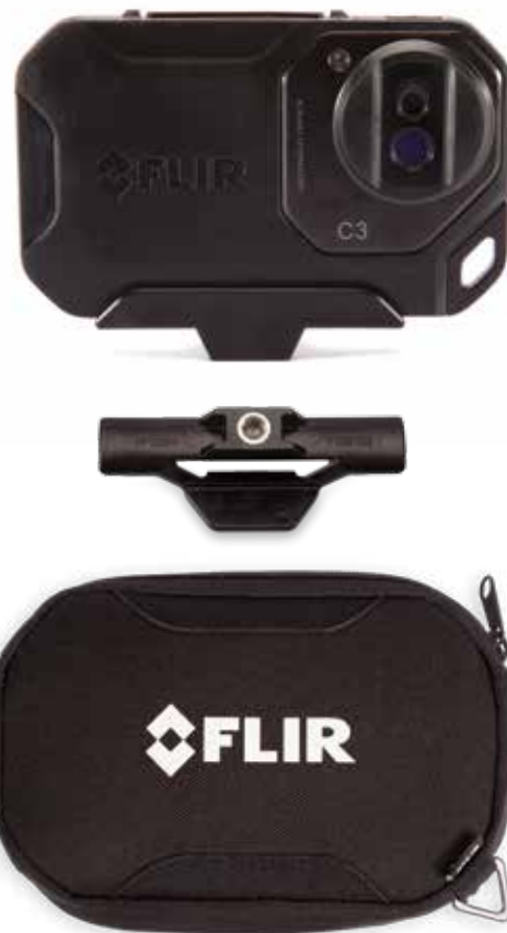
FLIR C3 with Tripod Mount & Carry Pouch

Specifications are subject to change without notice. For the most up-to-date specs, go to www.flir.com