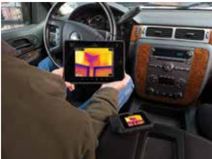
Upload images to FLIR Tools over Wi-Fi