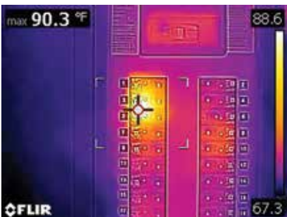
Area box with Hot Spot demonstrates electrical fuse is active