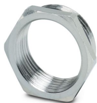
Reducing adapter, connecting thread: Pg29, color: silver, with O-ring

Please be informed that the data shown in this PDF document is generated from our online catalog. Please find the complete data in the user documentation. Our general terms of use for downloads are valid.