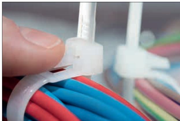
Releasable and reusable cable tie, REL-Series.