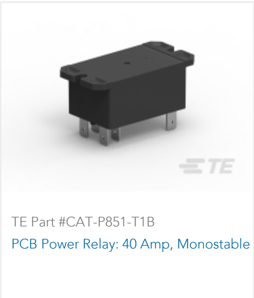
TE Part #CAT-P851-T1B PCB Power Relay: 40 Amp, Monostable