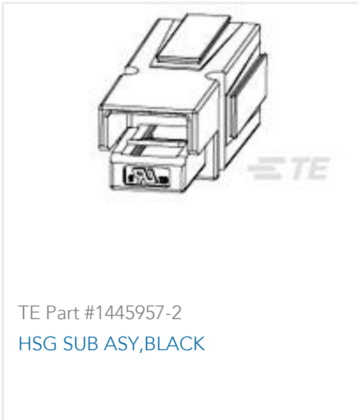
TE Part #1445957-2 HSG SUB ASY,BLACK