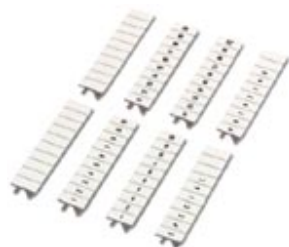
Zack marker strip, 10-section, horizontally labeled with the consecutive numbers: 241 ... 250, white, Width: 5 mm

Please be informed that the data shown in this PDF Document is generated from our Online Catalog. Please find the complete data in the user's documentation. Our General Terms of Use for Downloads are valid ( http://download.phoenixcontact.com )