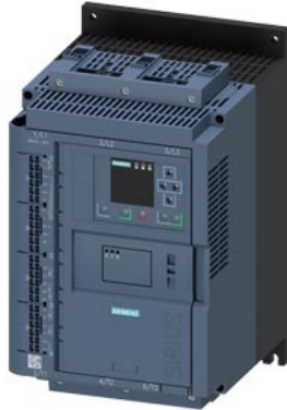
SIRIUS soft starter 200-690 V 47 A, 110-250 V AC spring-type terminals