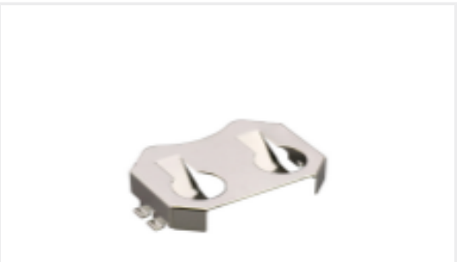
TE Part #BAT-HLD-001 Hldr fr CR2032 Batteries, SMT, Blk Pkg