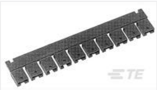
TE Part #382811-8 SHUNT, ECON, PHBR 5AU, BLACK