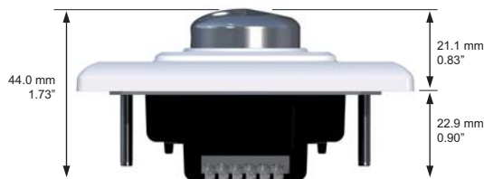
DimWheel faceplate - side view