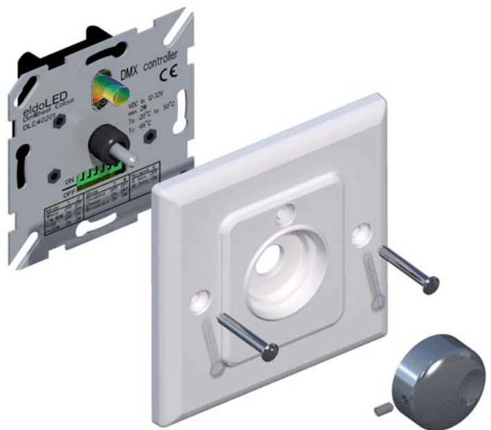
DimWheel Colour and DimWheel faceplate: a perfect fit