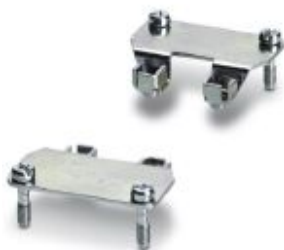
Adapter insert, type: D25

Please be informed that the data shown in this PDF Document is generated from our Online Catalog. Please find the complete data in the user's documentation. Our General Terms of Use for Downloads are valid ( http://phoenixcontact.com/download )