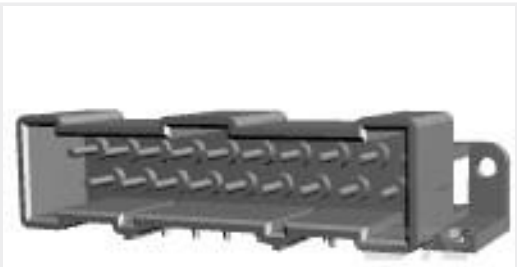
TE Part #208099-3 PIN HEADER ASSY, 19P, METRIMATE