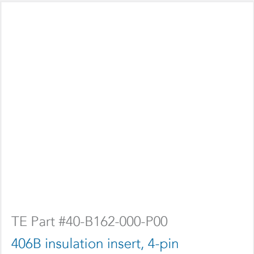
TE Part #40-B162-000-P00 406B insulation insert, 4-pin