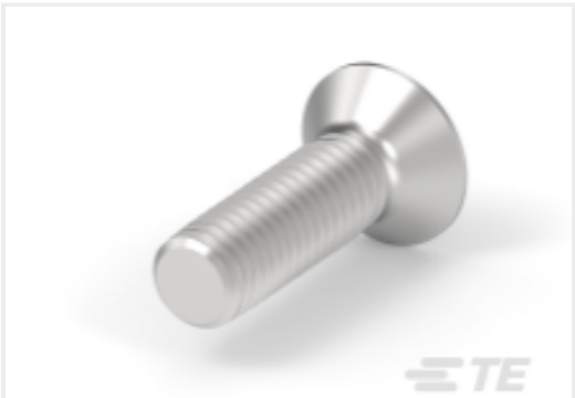
TE Part #D1-0134-041-P00 COUNTERSUNK SCREW TT2K M3 X 10