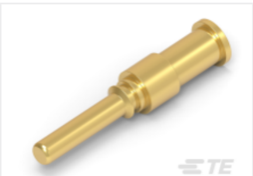
TE Part #61-0195-011-P00 CONTACT PIN 3.6 MM