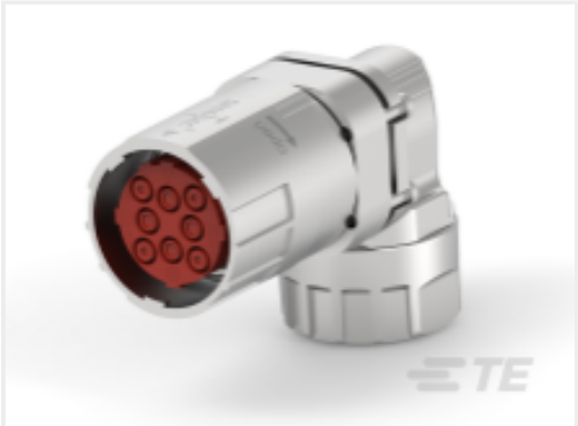
TE Part #CUA481N00450030000 940 PLUG, ANGLED, SPEEDTEC