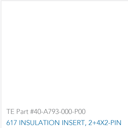
TE Part #40-A793-000-P00 617 INSULATION INSERT, 2+4X2-PIN