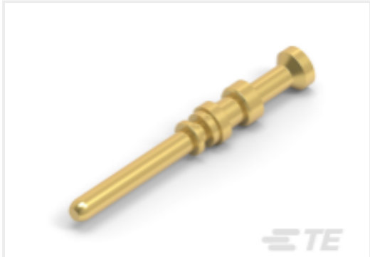
TE Part #61-0194-011-P00 CONTACT PIN 2 MM