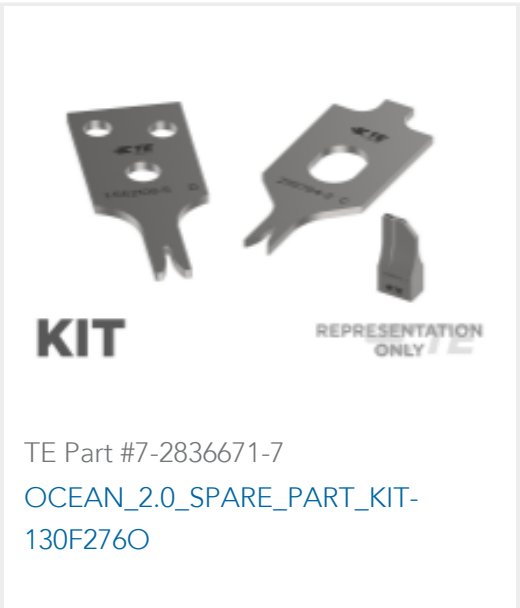
TE Part #7-2836671-7 OCEAN_2.0_SPARE_PART_KIT-130F276O