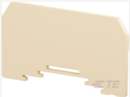
TE Part #1SNA198692R2500 SCH3