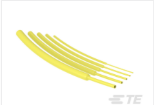
TE Part #NB14414001 VERSAFIT-3/4-4-FSP