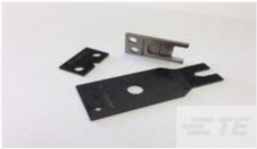
TE Part #7-240651-4 BLADE, SLUG