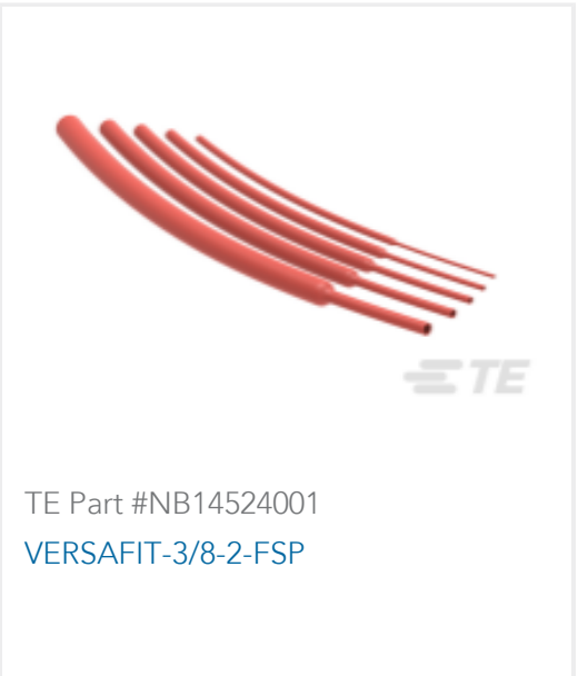
TE Part #NB14524001 VERSAFIT-3/8-2-FSP