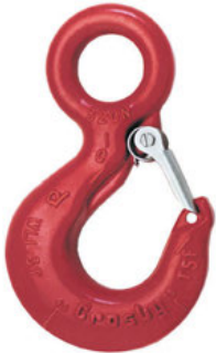
S-320N EYE HOOK