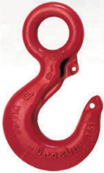
S-320 EYE HOOK