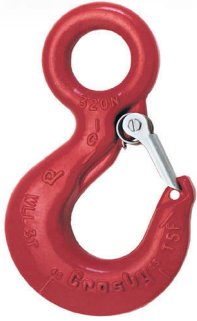
S-320N EYE HOOK