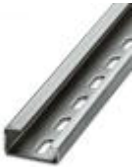
G-profile DIN rail, material: Steel, perforated, height 15 mm, width 32 mm, length 2 m

DIN rail perforated - NS 32 PERF 2000MM - 1201002