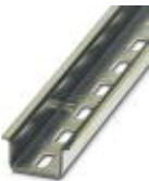
DIN rail, material: steel galvanized and passivated with a thick layer, perforated, height 15 mm, width 35 mm, length: 2000 mm

DIN rail perforated - NS 35/15 PERF 2000MM - 1201730