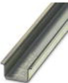
DIN rail, material: Steel, unperforated, height 15 mm, width 35 mm, length: 2 m

DIN rail, unperforated - NS 35/15 UNPERF 2000MM - 1201714