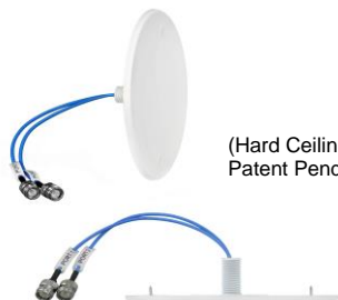
(Hard Ceiling Mount) Patent Pending CFD69383P1

These 2-port MIMO indoor wideband omnidirectional low-profile ceiling mount antennas are designed to provide pattern coverage optimized for indoor coverage requirements at 698-960 MHz and 1690-4000 MHz for the LTE, AWS-3, WCS, and CBRS/WiMAX frequency bands. The CFD69383P/CFD69383P1 are applicable for environments where aesthetics and wide-angle coverage are necessary for successful wireless deployment. Their small size and low profile enable maximum mounting flexibility while maintaining desired in-building aesthetics.