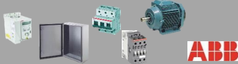
ABB products cover a large part of our Automation range. Key areas such as Motors, Inverters, Soft Starters, Contactors, Cam Switches, Circuit Protection, Industrial Switches, Pushbuttons are core to the offer, but did you know you can also find ABB Enclosures in our offer.

Adaptaflex flexible conduit systems are used to protect critical power and data cabling. Find a great range of conduit and fittings to complete your cabinet installations.