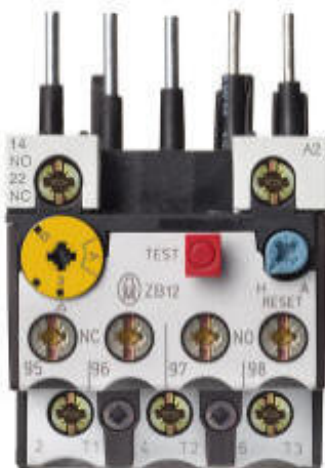
(ZB12-12 shown, actual part may vary)