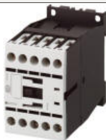
DILM Contactors for ZB12 Overloads