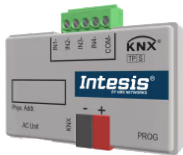
Daikin to KNX - 1 indoor unit

The Daikin-KNX interface allows full bidirectional communication between Daikin AC Domestic units and KNX installations. It has four potential-free binary inputs available to integrate and configure external devices (window contacts or presence detectors) to improve energy efficiency.