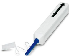
Ferrule cleaner, 1.25 mm, for LC, approx. 500 cleaning cycles

https://www.phoenixcontact.com/in/products/1407032