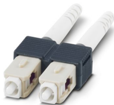
SC duplex multimode connector for wire or cable assembly

Please be informed that the data shown in this PDF document is generated from our online catalog. Please find the complete data in the user documentation. Our general terms of use for downloads are valid.