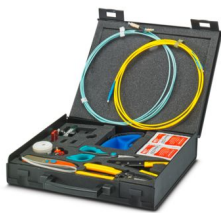
Tool set for GOF assembly

https://www.phoenixcontact.com/in/products/1089515