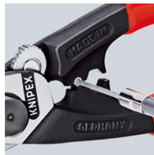
Crimping of the end ferrule onto the traction cable