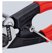
Crimping of the end caps on the Bowden cable sheath