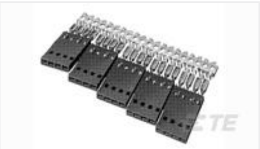
TE Part # 103970-1 10X2 MTE RCPT SR RIBBED .100CL