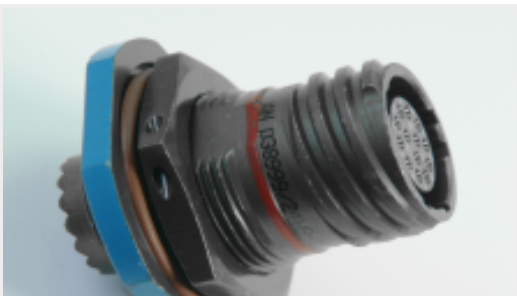
TE Part #YDTS24W15-97SCV001 RECP ASSY