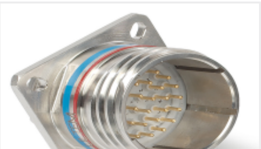
TE Part #YDTS20F11-05PDV001 RECP ASSY