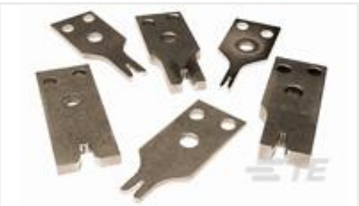
TE Part #456428-4 CRIMPER WIRE .180 F