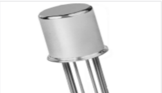
TE Part #3-1617119-1 J1MSCD-12XP = M39016/25-035P