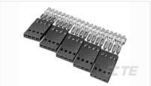
TE Part # 103648-1 02 MTE RCPT HSG SR RIB .100CL