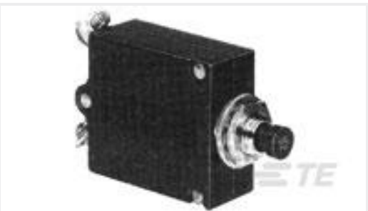
TE Part #2-1423678-0 W23-X1A1A-20=CKTBKR,THERM,PB,SCW,BUSH