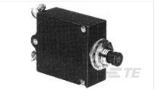
TE Part #2-1423678-1 W23-X1A1A-25=CKTBKR,THERM,PB,SCW,BUSH