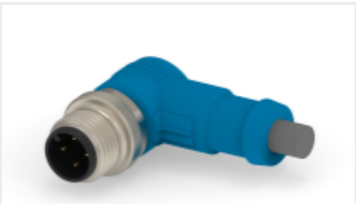
TE Part #T4161220004-003 RPC-M12-MR-4CON-PUR-1.5SH