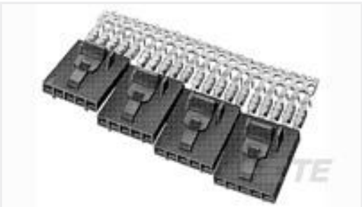
TE Part # 103958-1 10X2 MTE RPT SR LATCH .100CL