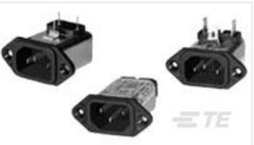
TE Part #6609000-6 3EEAP=F7650 S0