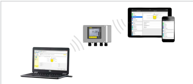
Wireless connection to smartphone/table/notebook

Operation is via a free app from the "Apple App Store", the "Google Play Store" or the "Baidu Store". Alternatively, adjustment can also be carried out via PACTware/DTM and a Windows PC.