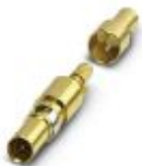
Coaxial contact, contact diameter: 4.8 mm, turned, Socket, contact material: Copper alloy, contact surface: gold-plated, connection cross section: 0.14 mm 2 ... 2.5 mm 2 AWG 26 ... 14, Wave impedance: 75 Ω

Coaxial contact - HC-M-04-BU-KOAX-75 - 1686258