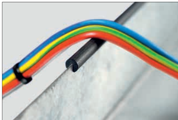
EdgeGuard protects against sharp panel edges.