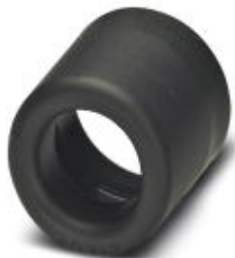
End sleeves as cable protection

Please be informed that the data shown in this PDF Document is generated from our Online Catalog. Please find the complete data in the user's documentation. Our General Terms of Use for Downloads are valid ( http://phoenixcontact.com/download )