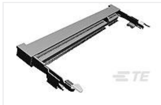
TE Part #1565917-4 EMBOSS ASSY DDR2 SODIMM SOCKET 200P 5.2H