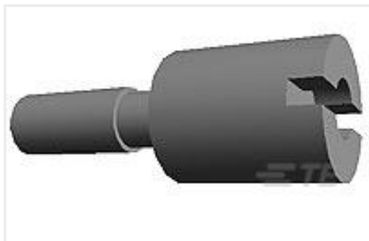
TE Part #787004-3 .8MM SCREWLOCK BRDMT,BULK