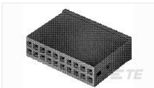
TE Part # 5-925369-0 MOD.HSG 50 P.