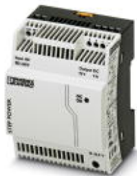
Primary-switched STEP POWER power supply for DIN rail mounting, input: 1-phase, output: 15 V DC/4 A

Please be informed that the data shown in this PDF Document is generated from our Online Catalog. Please find the complete data in the user's documentation. Our General Terms of Use for Downloads are valid ( http://phoenixcontact.com/download )