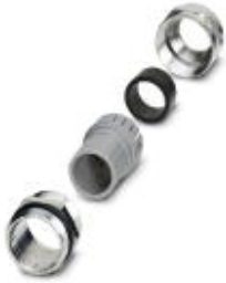
Brass screw connection, Pg13

Please be informed that the data shown in this PDF Document is generated from our Online Catalog. Please find the complete data in the user's documentation. Our General Terms of Use for Downloads are valid ( http://phoenixcontact.com/download )