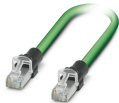
Patch cable, cable length: 30 m, number of positions: 4, 100 Mbps, CAT5, connection cross section: AWG 23- 22, PROFINET

Please be informed that the data shown in this PDF document is generated from our online catalog. Please find the complete data in the user documentation. Our general terms of use for downloads are valid.