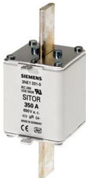
Similar to image

SITOR FUSE-LINK UTILIZ. CATEGORY GS, DIN 43620 500A , AC 690 V ,(SIZE 2)