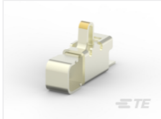
TE Part # 2289559-1 SPRING FINGER 2318 ANTI LIFT TYPE