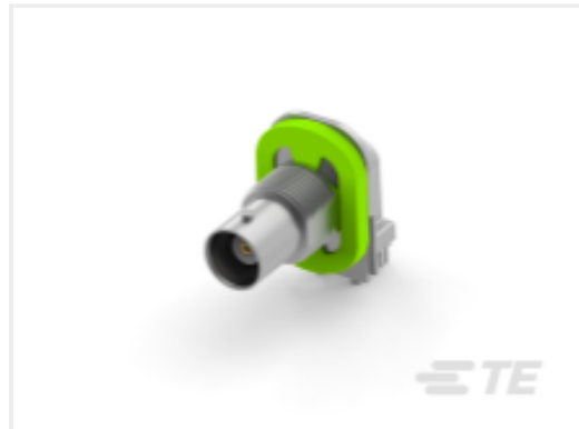
TE Part #2016166-1 JACK, R/A PCB, 50 OHM, BNC