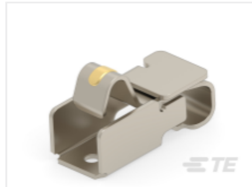
TE Part #2286211-3 HIGH CURRENT SPRING FINGER