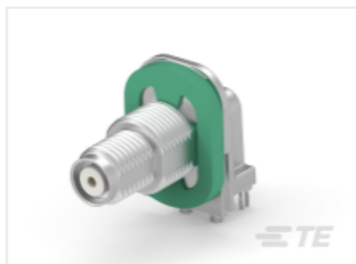
TE Part #2016167-1 MINI UHF, RTANG ASSY