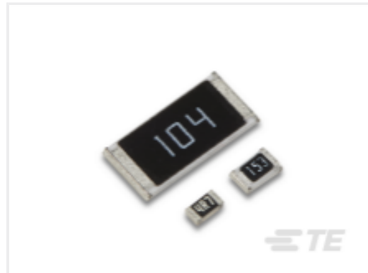
TE Part #3-2176337-8 CRGCO 0402 12K 1%