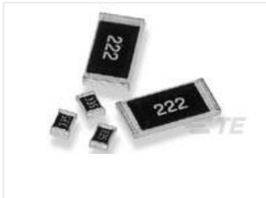
TE Part #2-1676480-6 CRG0402 1% 1K5