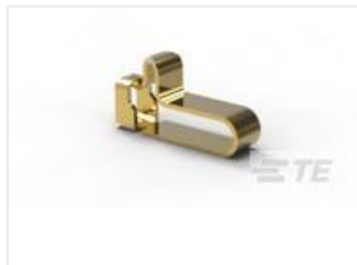
TE Part #1565322-1 SHIELD FINGER 1608