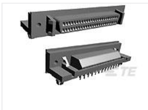
TE Part #5787082-5 50 50SR R/A RCPT ASSY,RDSN L/F