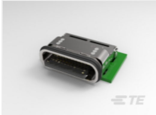
TE Part # 2305018-2 USB TYPE C, REC IPX8 ON BOARD DUAL SMT