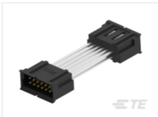
TE Part #364100-E DRCBTB 1,27 12 M BTB32 30,2 137 * 094 TR