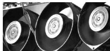
Fans in an endurance test cabinet at ebm-papst St. Georgen. 1500 fans are operated in temperature cabinets until they fail.

The life span calculations have been carried out to the best of our knowledge and are based on experience gained by ebm-papst. The specified L_{10} (40 °C), L_{10} ( T_{max} ) and L_{10IPC} (40 °C) values all allow statements to be made about the theoretical calculated service life under certain assumptions. The values determined here are extrapolations from our own service life tests and from statistical variables. In the respective customer applications, there may be different influencing factors that cannot be included in the calculations due to their complexity. The service life information is explicitly not a guarantee of service life, but strictly a theoretical quality figure.