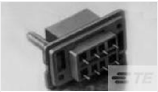
TE Part #5172068-3 DRAWER CONN FEMALE ASSY16P