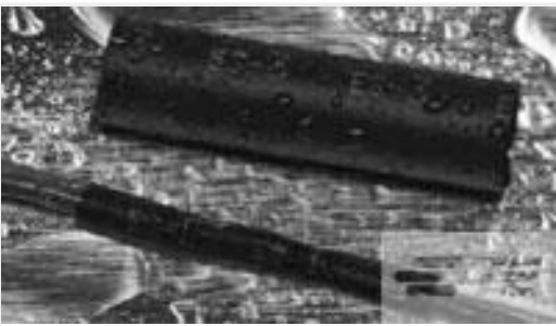
TE Part #121397P018 ES2000-NO.3-B8-0-50MM