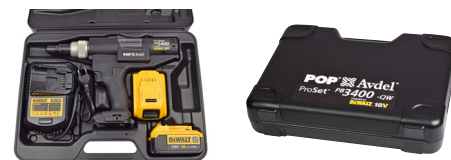
Robust tool case for outdoor installation