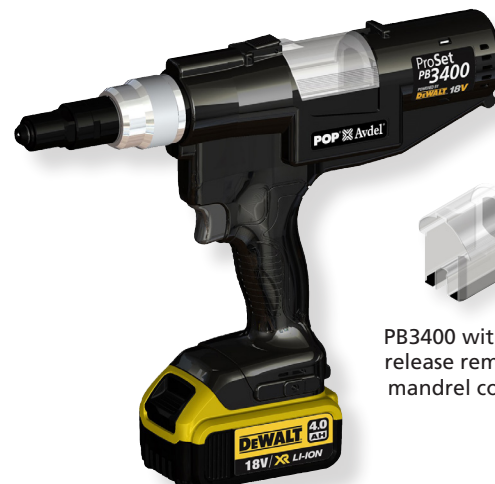
PB3400 with quick release removable mandrel collector